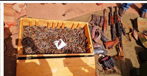
Arms and equipment seized by Burkinabe forces.