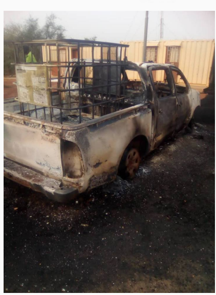
Vehicles destroyed by militants after attack on Inata gold mine gendarmerie post.