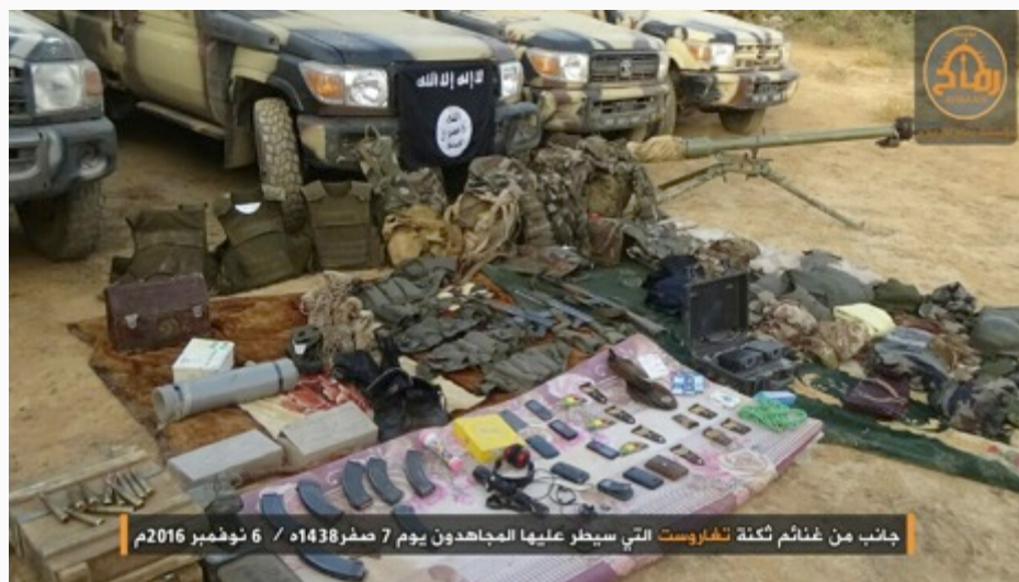
جانب من غنائم ثكنة تغاروست التي سيطر عليها المجاهدون يوم 7 صفر 1438هـ / 6 نوفمبر 2016م