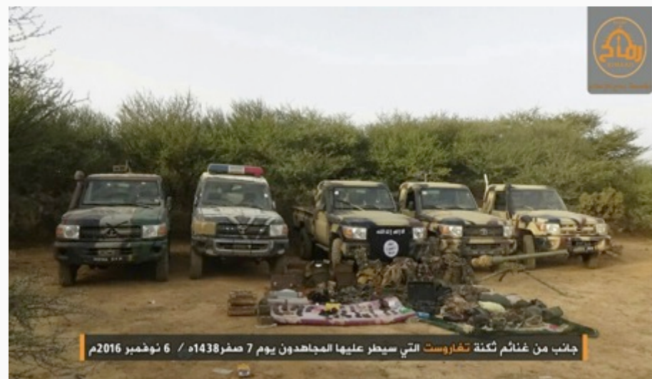
جانب من غنائم ثكنة تغاروست التي سيطر عليها المجاهدون يوم 7 صفر 1438هـ / 6 نوفمبر 2016م

Images of weapons, vehicles, and other military equipment seized by Ansar al-Din south after Gourma-Rharous attack on 06 NOV 16.