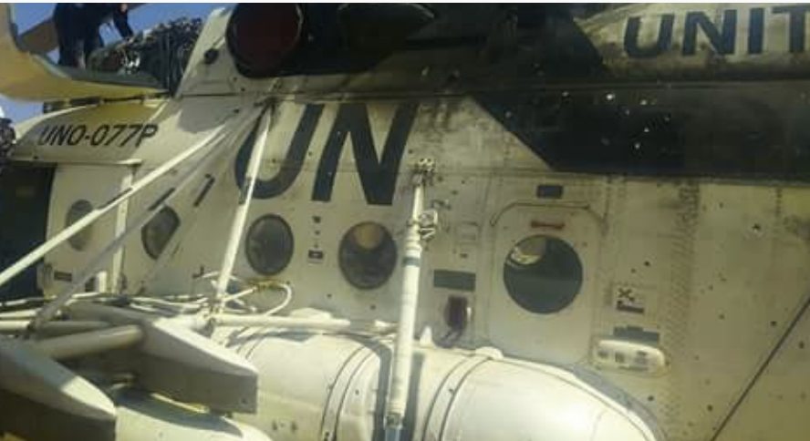
MINUSMA Helicopter damaged by rockets launched by Ansar al-Din.