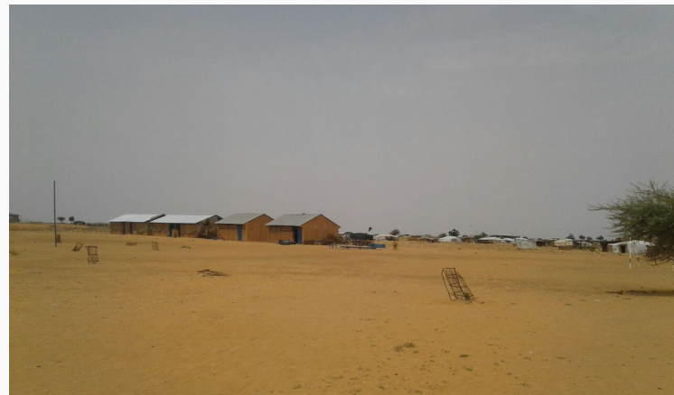
Refugee Camp Tabarey – Barey, Tillabéri Region.