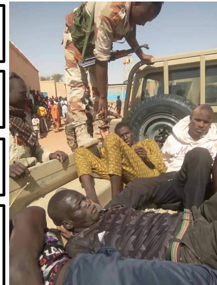
Ex-Boko Haram suspects arrested.

30 NOV 18 : Unidentified gunmen attacked police/customs post in Téra, Tillabéri Region. 1 customs officer killed while 1 assailant injured then arrested. The post is only 180km from the capital Niamey. Reportedly, gunmen attacked the police station to free one of their members detained at the location.