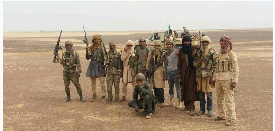
Images of MSA fighters in Ménaka Region.